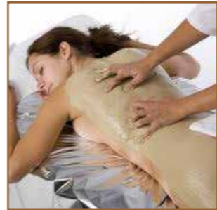
COFFEE THERAPY – detoxifying and cellulite