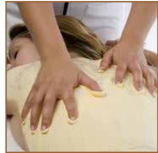
FRUIT THERAPY – full of antioxidants for dry and aging skin