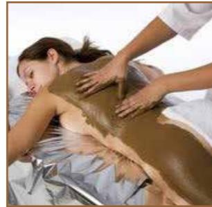
CHOCOTHERAPY – nourishes dry skin